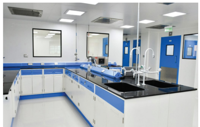
MEDS new microbiology lab which is expected to strengthen medicines quality testing services reaching several countries in Africa.

A Health Systems Award ceremony was held in 2022