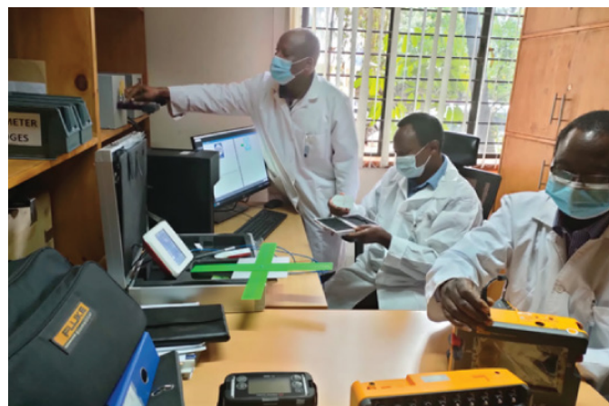
CHAK HCTS technical team in the Dosimetry Lab working on dosimetry reading for radiation monitoring badges and New Fluke Gas Flow Analyzer for Anaesthesia equipment calibration and quality assurance, all acquired from Germany through support by BfdW.

HCTS services must be self-sustaining hence a fee is charged for service, which we believe is competitive