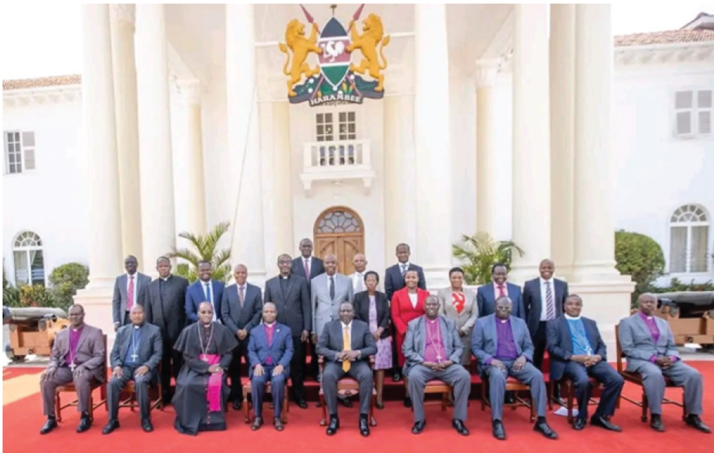
Religious Leaders from CHAK, KCCB, NCKK and MEDS during a meeting with the H.E Dr. William Samoei Ruto, President of the Republic of Kenya, at State House Nairobi, on February 7, 2023. The President was accompanied by CS-Health, CS-Education, DG Health, NHIF Board Chairman and other Government officials. The meeting discussed opportunities and strategies for strengthening collaboration and partnership between FBOs and the Government in the delivery of quality health and Education services.