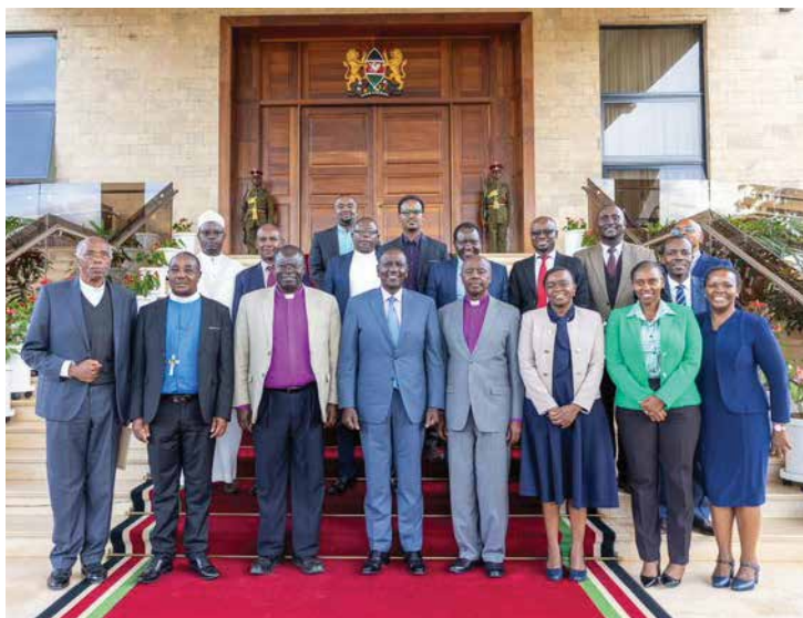
Delegation of religious leaders from CHAK, KCCB, MEDS and SUPKEM who held an engagement meeting with the President at State House, Nairobi, on March 25, 2025, to discuss the health financing crisis facing faith-based health facilities and the challenge of unpaid bills by SHA and the now defunct NHIF.