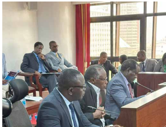
CHAK General Secretary and Chair of the Kenya Faith Based Health Services Consortium joined private sector representatives to engage the Parliamentary Health Committee on SHA challenges.

CHAK General Secretary and Chair of the Kenya Faith Based Health Services Consortium engaged the Parliamentary Health Committee together with private sector representatives to address the challenges health service providers were experiencing with SHA. The engagement also included discussions on improving primary health care and social health insurance under SHA.